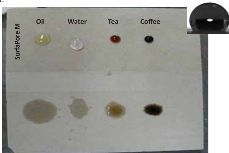
VOC (Volatile Organic Compounds): Maximum VOC content of this product is 1g/L.

Water absorption under low pressure (RILEM Test Method 11.4): The test procedure determines the water absorption rate of a concrete surface. Loss of water is inversely proportional of waterproofness. After 24 hours with water contact treated sample exhibited 0,8 cm 3 absorption, while the untreated absorbed 1,2 cm 3 . Water Vapor Transmission of Materials (ASTM E 96): Water vapor permeability was determined as the rate of water vapors passes through a 1cm thick porous stone sample. Vapor Permeability Loss: 2,12% (surface application). Food stains resistance: SurfaPore M porous modified surface is not susceptible to food stains and the results are exhibited in the figure below. Contact angle measurement: treated marble demonstrates 127° with water droplet.